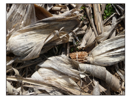
Residue breakdown leads to future issues.