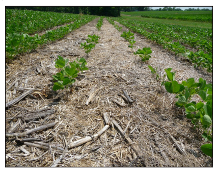
Residue issues at planting.