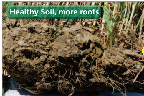
Healthy Soil, more roots