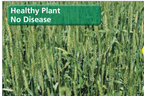
Healthy Plant No Disease